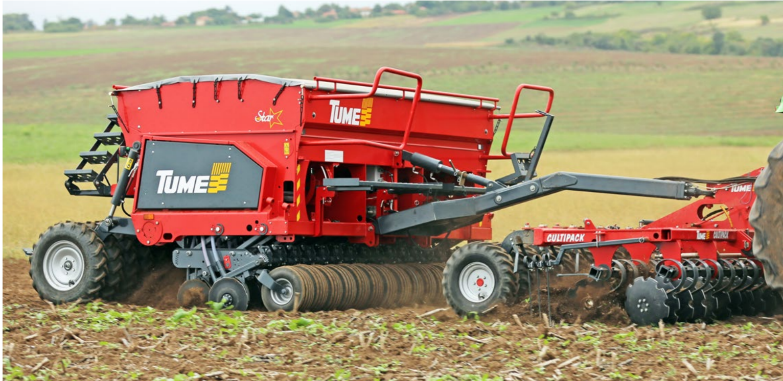
THE DRAWBAR CAN BE MOUNTED IN THE UPPER POSITION FOR APPLICATIONS SUCH AS CULTIPACK COMBINATION.

Nova Combi is reliable, easy to control and saves with fertiliser costs.