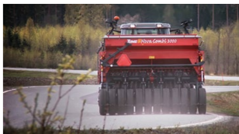
THE TRANSPORT WIDTH OF NOVA COMBI 3000 IS ONLY 3 METERS.

Nova Combi, with its unparalleled seeding accuracy and economy, has been hugely successful in tests and competitions around the world.