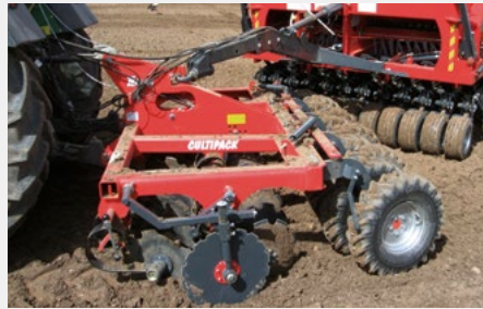
Hydraulic markers Grass seeders Rear harrow