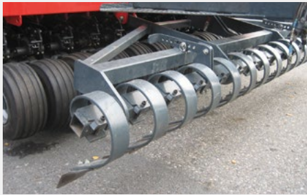
Front levelling board