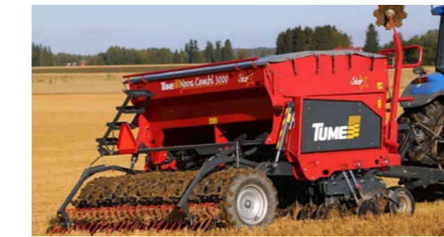
ROBUST WHEEL SET, ADAPTIVE SET OF COULTERS.